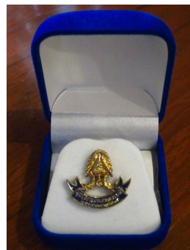
Students and teachers each received an emblem for participating in this fundraiser.