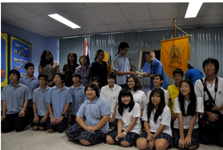
His Majesty the King's secretary (seen at the back) was present and personally received the donation.

During the winter break, on December 19 th , 2011 the Thai classes of grades 9 and 10 went on a trip to the Rajaprajanugroh Foundation (under the Royal Patronage of His Majesty the King) in Bangkok and delivered a total of 24,374 baht to the foundation. The money was collected with the help of the Grade 9 and 10 Thai classes through previously arranged bake sales and the Family Fun Day event. The total amount of money received from the bake sales was 3,213 baht while 21,161 baht was collected from the Family Fun Day.